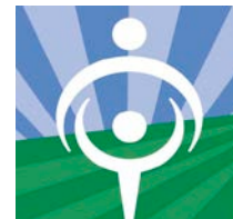
North American Guidelines for Children's Agricultural Tasks