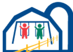
Creating Safe Play Areas on Farms